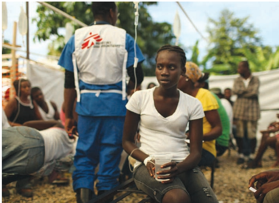
About 200,000 people in Haiti have been sickened by cholera since the outbreak began in October.