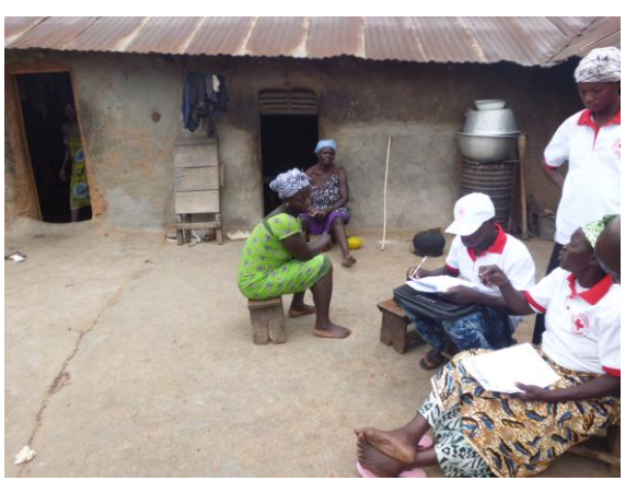
Volunteers using the CBHFA cholera guide during house to house education.

A rapid assessment was carried out prior to the response operation by GRCS volunteers to determine the risk factors and to identify any gaps that were not covered by other stakeholders during the outbreaks. The Ghana Red Cross Society (GRCS) cholera intervention was designed to increase the capacity of the two districts which were affected by the cholera epidemic to mitigate the effects of the outbreak at both the household and community levels.