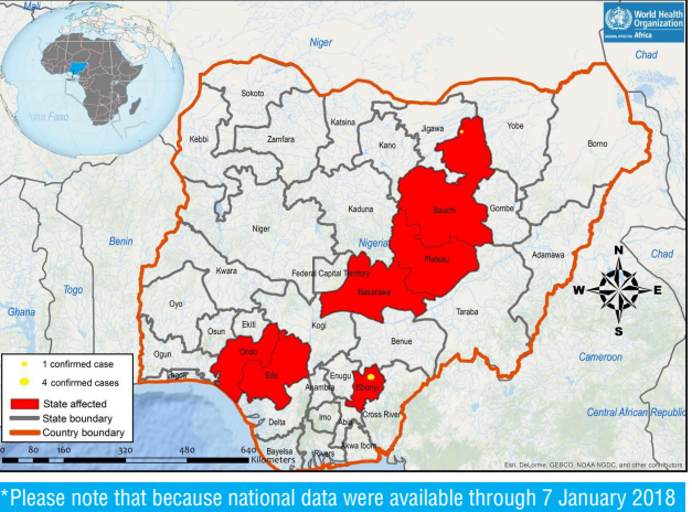
at the time of weekly bulletin publication, these data may not be complete for 7 - 16 January reporting period.