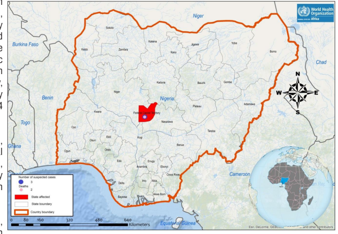
Geographical distribution of suspected botulism cases in Nigeria, 9 - 16 January 2018

and nausea, and headache on 6 January 2018. By 8 January 2018 she had developed diplopia, which is now (16 January 2018) intermittent, with blurred vision. She was managed under close observation in the ward, with the Intensive Care Unit on standby. By 16 January 2018, her abdominal pain and headache had subsided, and she had no further nausea. As of 18 January 2018, she was still an inpatient at the Zenith Medical and Kidney Centre.