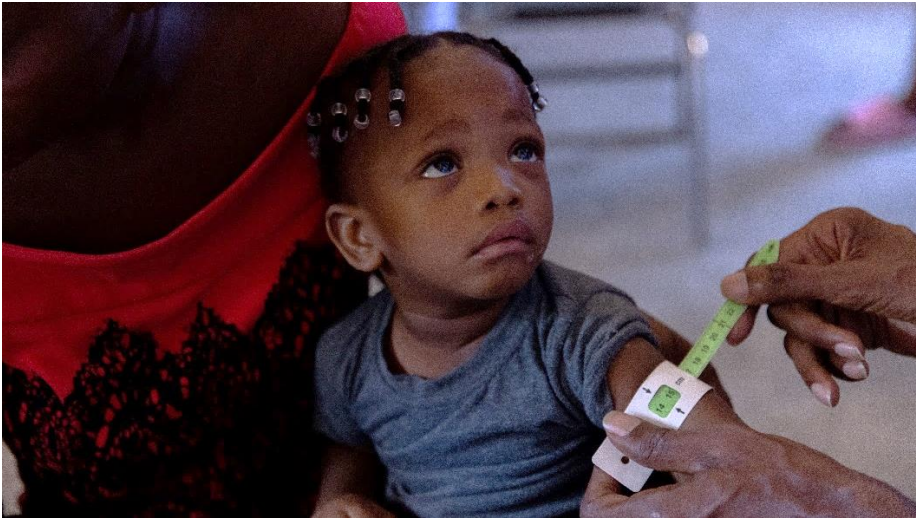
A child being screened for malnutrition during a mobile clinic deployed by UNICEF and its partners in displaced site.