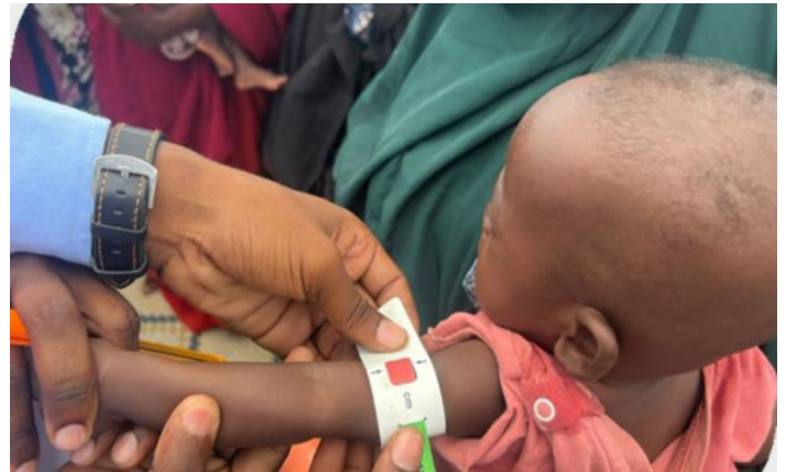
Malnutrition screening exercise in Hawaadley.

focusing on referring Severe Acute Malnutrition (SAM) cases with complications to Jowhar. IMC facilitated the referral of 20 severely malnourished children to Jowhar General Hospital. Tragically, one child passed away before reaching the hospital, but the remaining 19 children received treatment at the Stabilization Center in Jowhar General Hospital, managed by IMC, and have fully recovered.