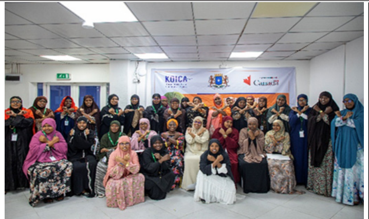
Midwives and Reproductive Health Managers at a MISP training in Mogadishu

HEALTH CLUSTER BULLETIN NOVEMBER/DECEMBER 2024