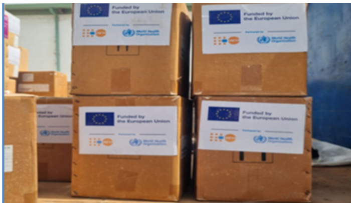
National NGO partners taking part in the assessment

WHO, with support from ECHO, provided essential medical supplies to health cluster partners in Banadir, including Concern Worldwide, Action Against Hunger, and SOS Children's Villages through the Cafimad Plus Consortium. The supplies included Severe Acute Malnutrition (SAM) treatment kits, Interagency Emergency Health Kits (IEHK), and medications for managing measles and pneumonia. These provisions aim to strengthen healthcare delivery and enhance partners' capacity to provide timely and effective medical care to vulnerable communities in Deynile and other parts of the region.