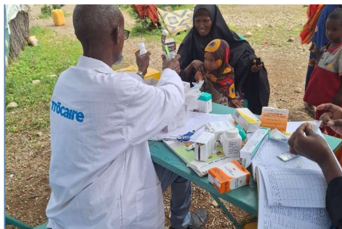
Health service provision in Luuq.

The second-round orientation exercise for the “big catch up” was done together on 7th November 2024 by Health Cluster, MoH, WHO, UNICEF. In November, Trocaire started implementation of a three-month emergency response project aimed at providing lifesaving emergency health services to displaced vulnerable populations affected by the inter-clan conflict in Luuq. The project involves integrated mobile clinic services covering both Yurkut and Luuq locations. Outreach teams are focusing on IDP camps in Luuq, including Bilcin Barako, Madina/Hillaac, Kaheyne, and Dogob, as well as high-displacement areas in Yurkut such as Bashiiro, Garas Americo, and Barbaara Ciise. Also in November, Trocaire started health service delivery in two health centers in Kismayo funded by ECHO. The supported facilities are Howlaha Makaiibta and Gulwada Health Centers. This project also supports one outreach team in Kismayo. Additionally, Trocaire have successfully secured funding from FCDO to support the Qansaxley Health Centre, Dollow through to next year in response to La Nina effects.