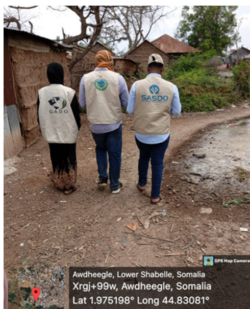
National NGO partners taking part in the assessment

The region has faced challenges due to ongoing conflict, but recent efforts have aimed at stabilization and rebuilding. Awdhegle benefits from its proximity to Afgooye for commercial and logistical support while maintaining a more rural environment. Historically, the area has encountered environmental challenges. including floods, drought, and conflict. 46% of the sites reported the absence of health facilities or medical outreach teams at the relocation, evacuation sites, or within the affected communities impacted by the flooding. 89% of the sites reported an increased need for health services in the community since the flooding. 100% of the sites reported an increase in cases of acute diarrhea, measles, and respiratory illnesses following the flooding.