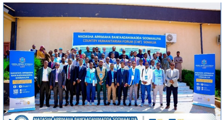
Country Humanitarian Forum in Dusamareb

In Galmudug state, five (5) new case of diphtheria were reported in November, 2 out of these 5 cases died. A total 158 diphtheria cases have been reported in Galmudug since last year. Round two BIG catch-up vaccination was conducted on 19-25 November to reach unimmunized children. During the month of December, the Health Cluster participated in the High-Level Country Humanitarian Forum (CHF) meeting, held in Dhusamareb, Galmudug State, Somalia.