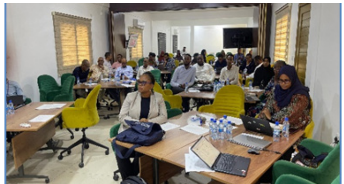
Joint Health and Nutrition Clusters meeting in December 2024

The Health Cluster Mental Health and Psychosocial Support Working group welcomed a new team member, who is a mental Health Specialist. This new addition will boost the work of the MHPSS working group, to ensure.